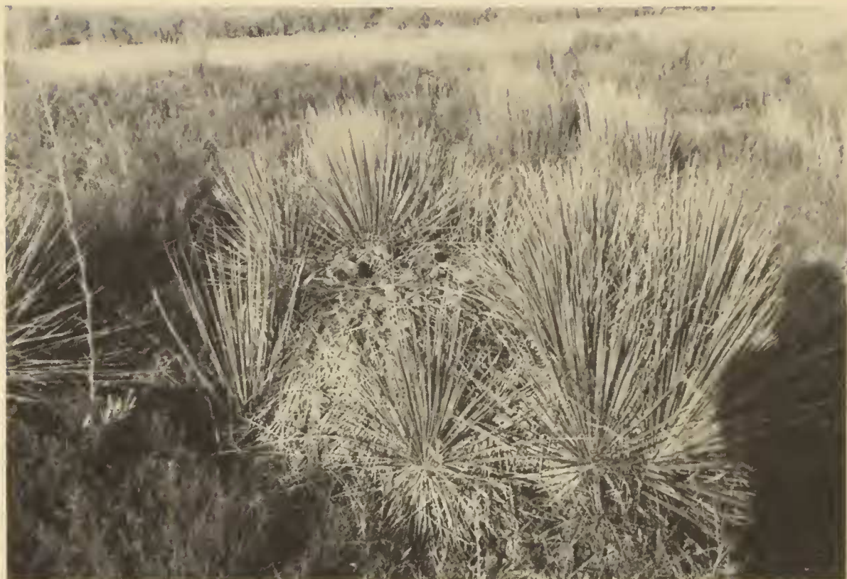
FIG. 16.—Nest of Neotoma micropus in yucca, northwestern Roberts County.

16, 19, and 20 in July and 15 in November. Juveniles were collected in April, July, and August. An adult female was in seasonal molt on 18 July.